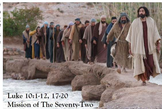
Luke 10:1-12, 17-20 Mission of The Seventy-Two

Persistence in prayer is a desirable quality but it has nothing to do with the parable of the friend in need who asks only once for "three loaves" and can expect to receive them. The translation "persistence" seems to derive from association with the repetition of seeking and searching and knocking, in other words with the sayings that form the third little cameo. Here Jesus draws on the experience of his listeners: if flawed disciples know how to give "good gifts" to their children, then they should not be surprised that those who ask for the Holy Spirit will receive this best of all gifts from God as they seek to renew the face of the Earth.