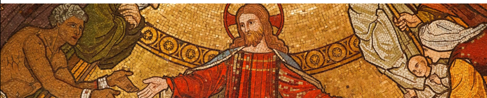
Accessed on 12th April, 2022 from Liturgy Help www.liturgyhelp.com