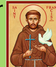
St Francis of Assisi, Landsborough