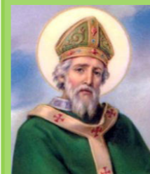
St Patrick's, Stawell