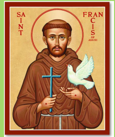
St Francis of Assisi, Landsborough