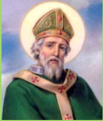
St Patrick's, Stawell