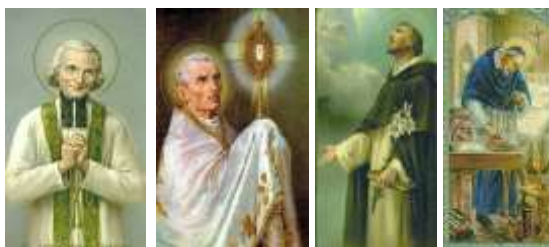
St John Vianney St Peter Julian Eymard St Dominic. St Alphonsus

Come for all or part of that time to pray with the Lord in the Blessed Sacrament. Rosary at 2.10, Benediction to conclude