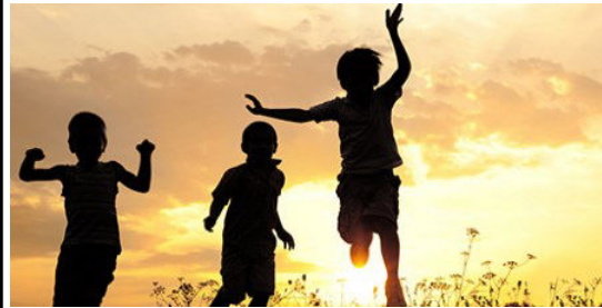
See me, Hear Me is the theme for Child Protection Sunday (ACBC)

The Church in Australia will dedicate this Sunday as Child Protection Sunday, a day to raise awareness and highlight the importance of keeping children safe, says the National Committee for Professional Standards.