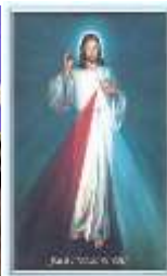
Second Sunday of Easter