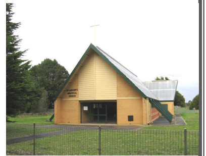
St Andrew's Simpson