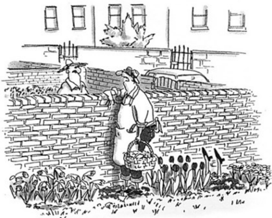
"I planted Iris this year. Next year I think I plant her mother."

However, applications can always be made through the Parish Secretary.