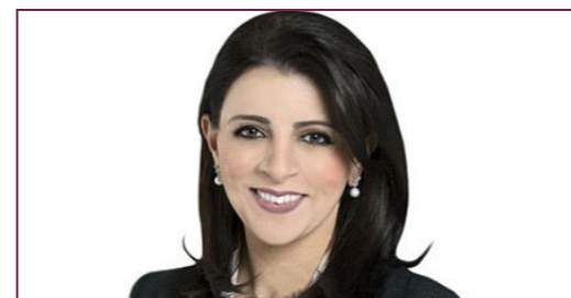
Marlene Kairouz

Victorian Labor frontbencher Marlene Kairouz says she is deeply concerned about the number of people “committing suicide” under the Andrews Government’s euthanasia laws. Source: The Australian.