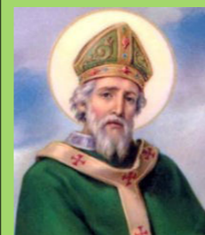
St Patrick's, Stawell