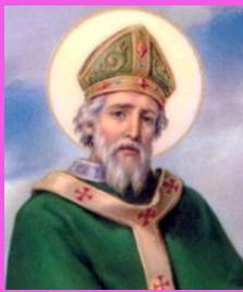
St Patrick's, Stawell