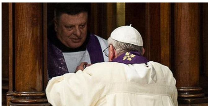
Pope Francis participates in the Sacrament of Reconciliation at the Vatican

Posted on December 10, 2019 by Administrator 1