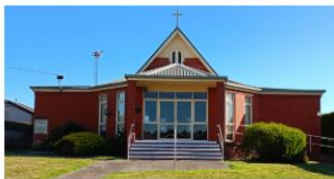
St. Brendan's Church 67, Curdie St, Cobden