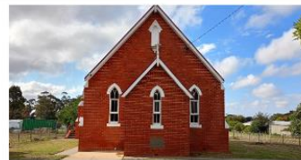
St. John's Church 53, High St, Lismore