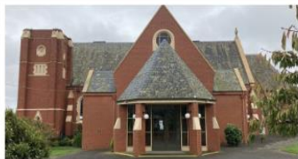
St. Patrick's Church Camperdown

Wall Street Camperdown, PO Box 64, Camperdown VIC 3260 Ph: (03)55931284 Fax: (03) 55932784 Email: camperdown@ballarat.catholic.org.au