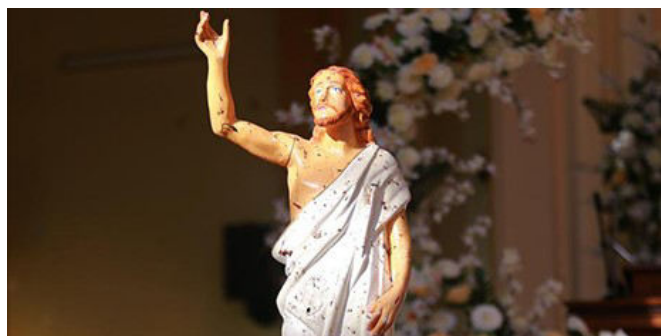
A blood-stained statue of Christ in St Sebastian Church in Negombo, Sri Lanka