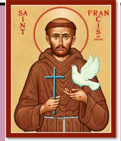
St Francis of Assisi, Landsborough

As we celebrate, we acknowledge the Indigenous owners of the land on which our Churches are built, the Tjapwurong people, and we respect the presence of the spirits of their ancestors among us.