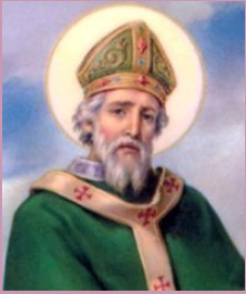
St Patrick's, Stawell