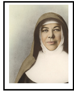
Mary Helen MacKillop RSJ (15 Jan 1842 – 8 Aug 1909)