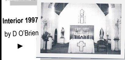
Interior 1997

LOVE & BLESSINGS TO ALL OUR CLUNES' PARISH FAMILY on this sad & historic occasion as you formally close St Thomas Aquinas' doors as a weekend Mass Centre