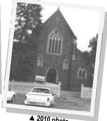
▲ 2010 photo http://www.victorianplaces.com.au/clunes