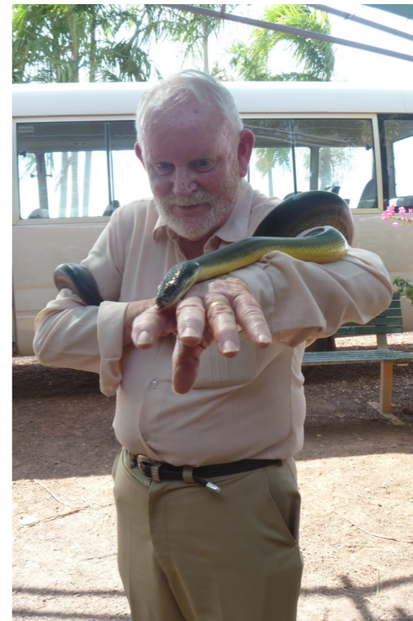
The Trip on The Ghan—2011 and loving the animal encounters.