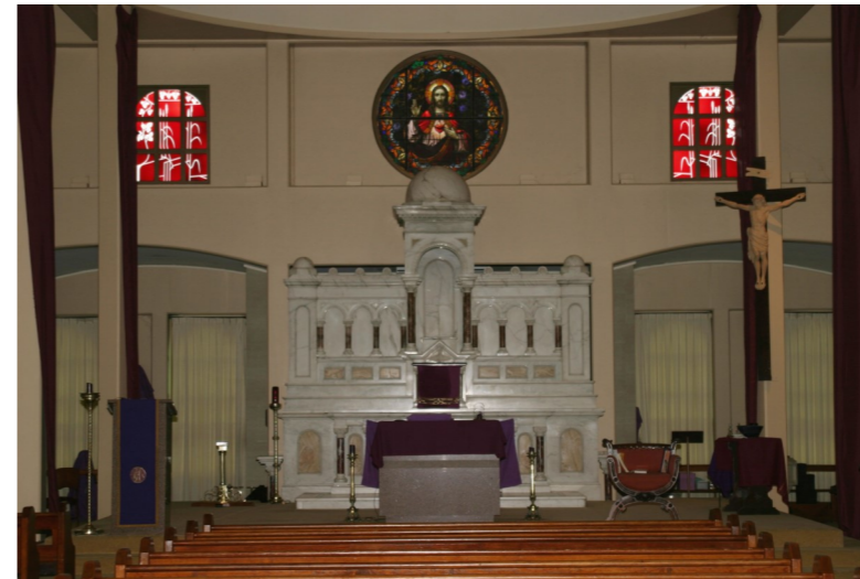
The Church Altar before the fire in 2007