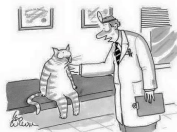
"Bad news, its curiosity"