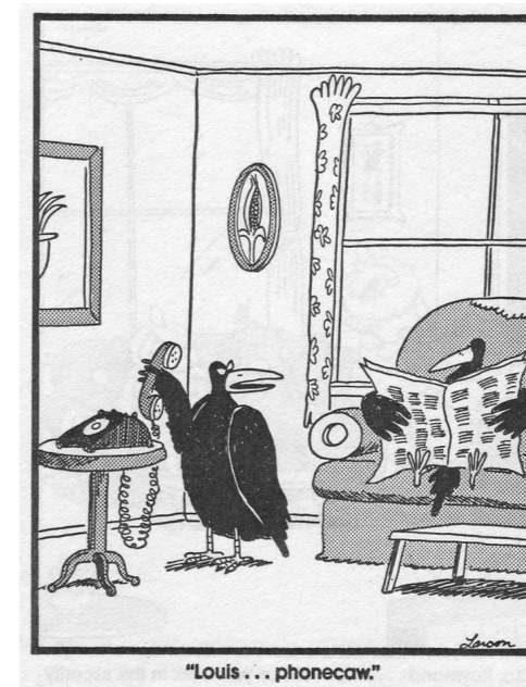
"Louis....phonecaw" Gary Larson