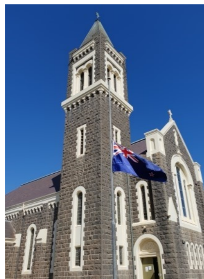
New Zealand Flag flying at half mast today Friday March 22nd 2019 Remembering those in Christchurch