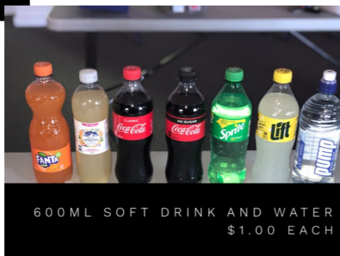
600ML SOFT DRINK AND WATER $1.00 EACH