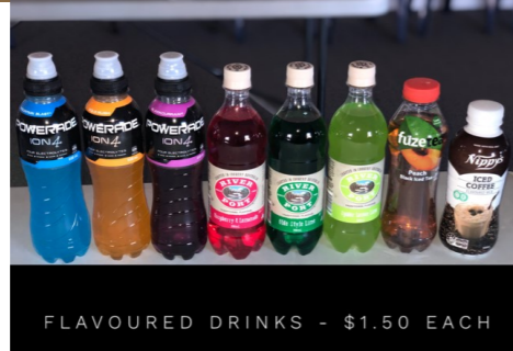
FLAVOURED DRINKS - $1.50 EACH

All drinks are within date and have been donated. A very big thank you to the Stapleton Family. Thank you to all the people who donated jars and ingredients to the café.