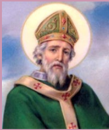
St Patrick's, Stawell