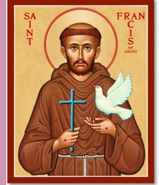
St Francis of Assisi, Landsborough

As we celebrate, we acknowledge the Indigenous owners of the land on which our Churches are built, the Tjapwurong people, and we respect the presence of the spirits of their ancestors among us.