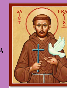
St Francis of Assisi, Landsborough