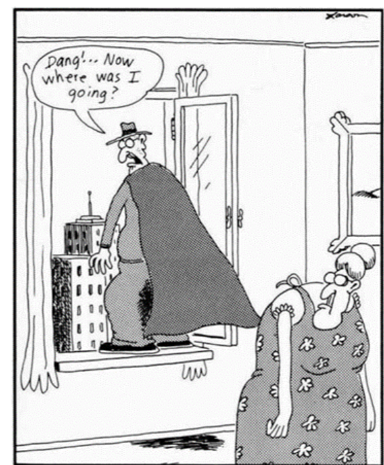
Superman in his later years