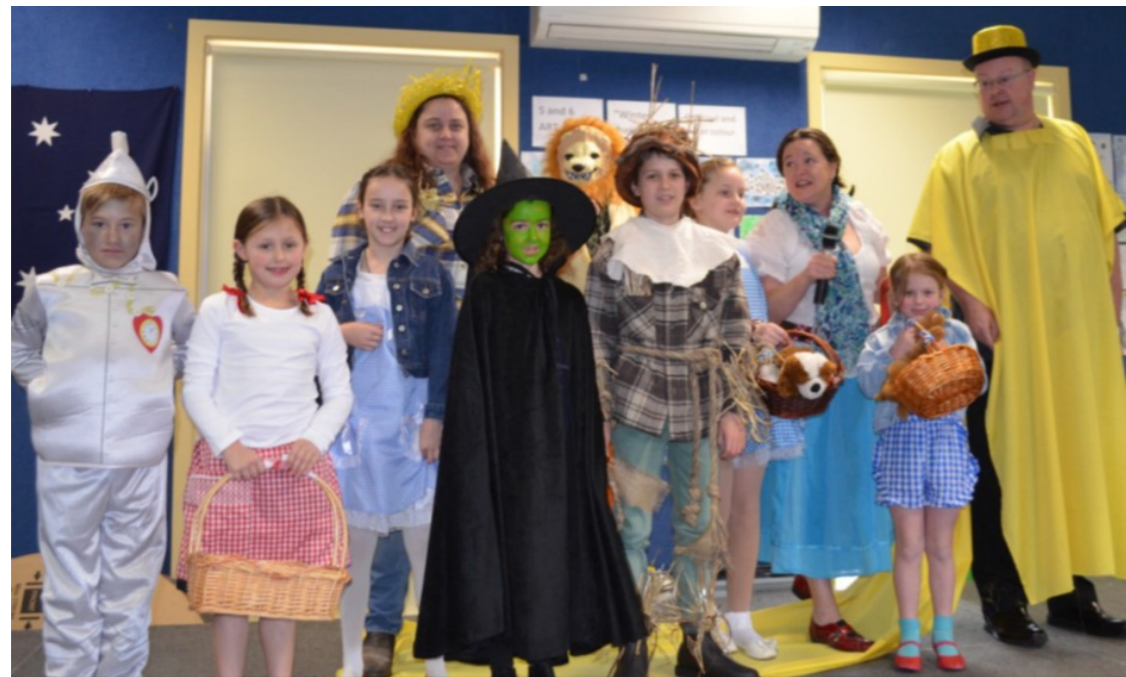
Book Week (last Friday) at St. Mary's saw a visit from the Yellow Brick Road and Dorothy Snr with most of the cast from the Wizard of Oz!