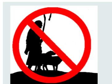
"Wait a minute! Isn't anyone here a real sheep?"