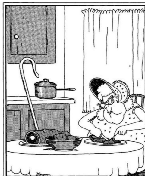
That evening, with her blinds pulled, Mary had three helpings of corn, two baked potatoes, extra bread, and a little lamb.