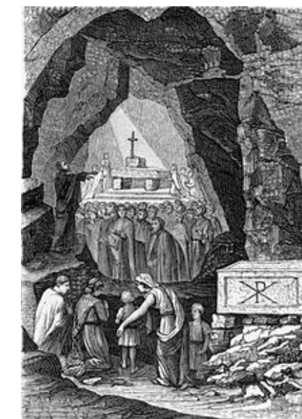
Early Christians celebrating Mass in the Catacombs.