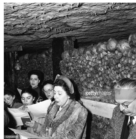
Mass in the Catacombs of Paris—1951