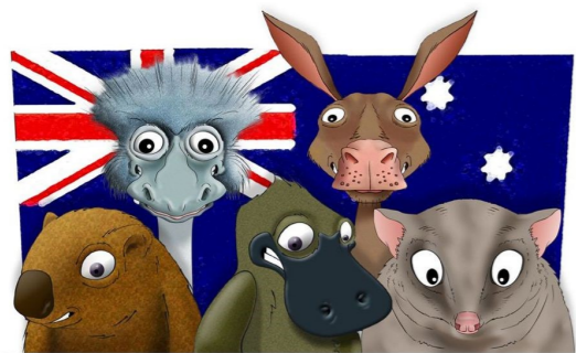
Celebrate Australia Day Australia Day - 26 January australiaday

In bible times the shepherds were considered by many to be of less worthy social standing. They were marginalized by the social and religious elite. In 2017 we still have “shepherds” who are less worthy of sanctuary in our country, less worthy of our company, less worthy of a place in line for holy communion. In 2017, in St Mary’s Parish, we are committed to the eradication of the “shepherd”, to the eradication of the label “less worthy.”