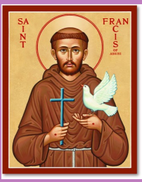
St Francis of Assisi, Landsborough