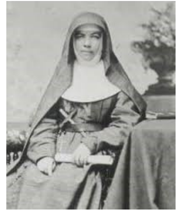
@ Mary MacKillop

Ever generous God, You inspired Saint Mary MacKillop To live her life faithful to the Gospel of Jesus Christ and constant in bringing hope and encouragement to those who were disheartened, lonely or needy. With confidence in your generous providence and through the intercession of Saint Mary MacKillop We ask that you grant our request..... We ask that our faith and hope be fired afresh by the Holy Spirit so that we too, like Mary MacKillop, may live with courage, trust and openness. Ever generous God hear our prayer. We ask this through Jesus Christ. Amen.