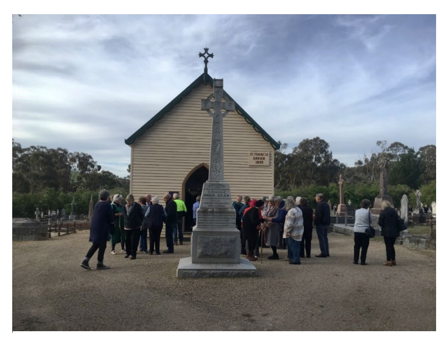
St Francis Xavier Chapel (1865) and Cemetery at Eganstown is the only Catholic Cemetery in the Diocese and only one of three in the state of Victoria, with Kilmore and Sandon